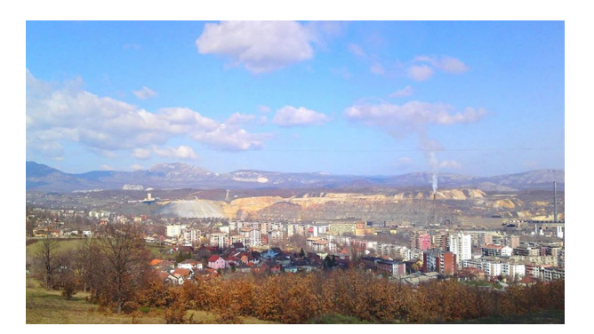
Fig. 3. The town of Bor

Cerovo (1990). These mines are situated on the north-eastern rim of the town, so that the open pit, the metallurgical smelting complex and the flotation tailings pond make a boundary between the urban and the industrial zones ( Fig. 2 ).