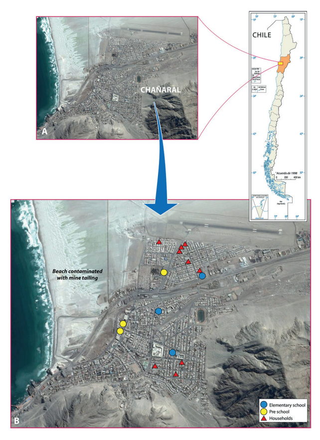
Fig. 1. (a) Extension of the beach with residues of the mining activity (tailings). (b) Location of the city of Chañaral.

The city of Chañaral is located adjacent to the bay (Fig. 1); its population is constantly exposed to dust and particulate material that rises by wind action, especially in the spring and summer months